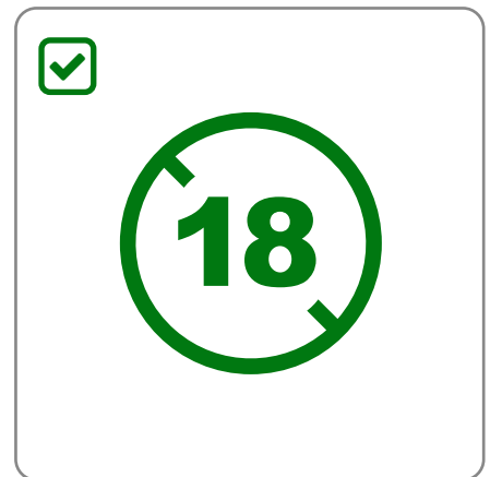
Over the age of 18